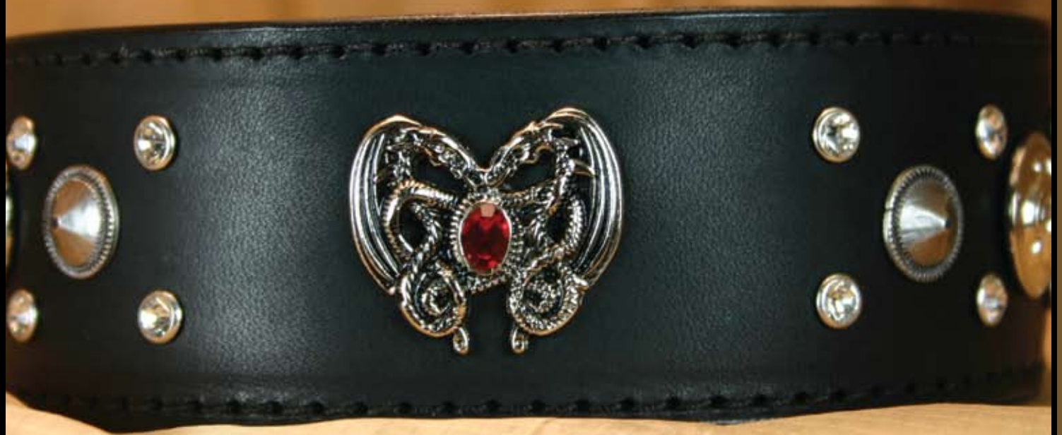
Gaelic Dragonheart Item #9517 Black Leather with Antique Nickel