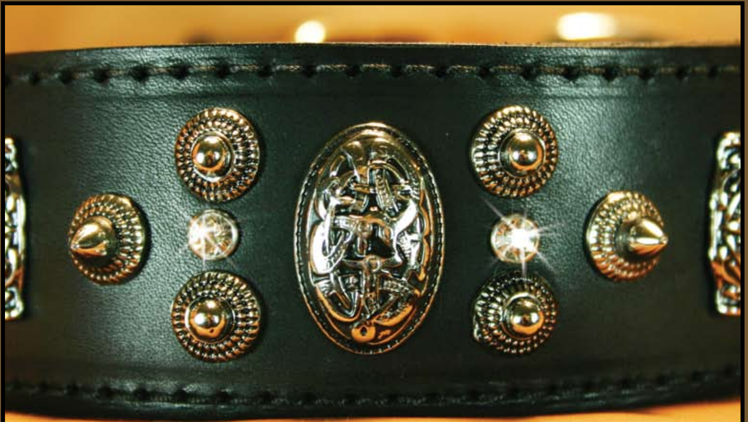
Thor's Hammer - Antique Nickel Centerpiece