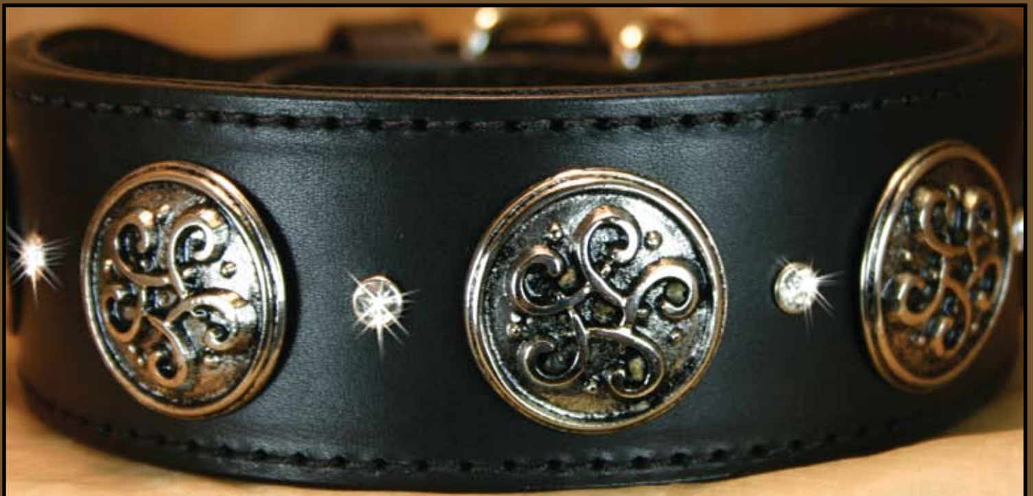
Midgaard Oval Item #9258 Antique Nickel on Black Leather