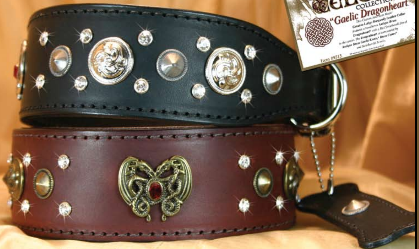
Gaelic Dragonheart Item #9515